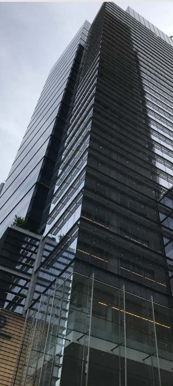
Synechron's New York Office at 11 Times Square, NYC