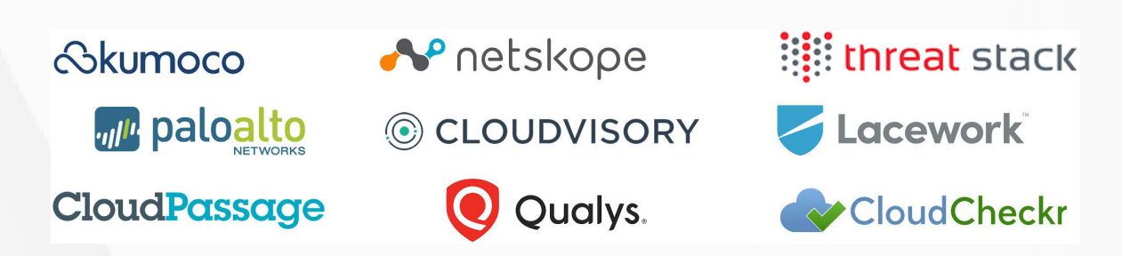
Figure 3: Sample of Vendors offering Continuous Compliances Solutions

As with any vendor evaluation, organisations need to consider the level of support on offer, including the speed with which partners respond to change requests, and balance this against the responsiveness of their own in-house IT organisations.